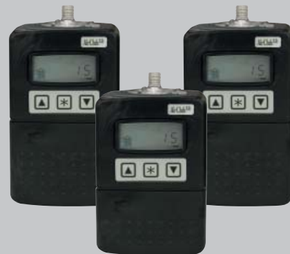
Three battery options