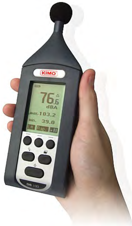
*Livré avec écran anti-vent