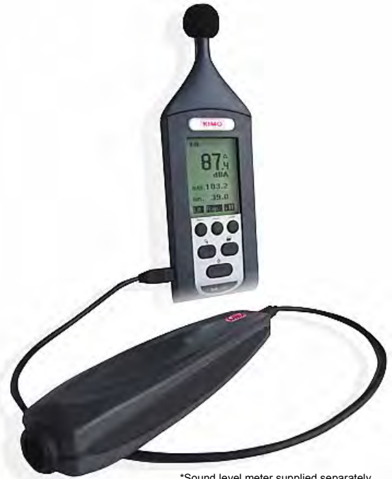
*Sound level meter supplied separately