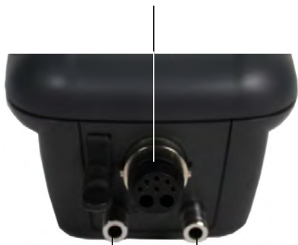
P- pressure plug P+ pressure plug Bottom view