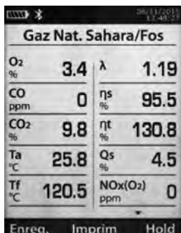
Example of analysis