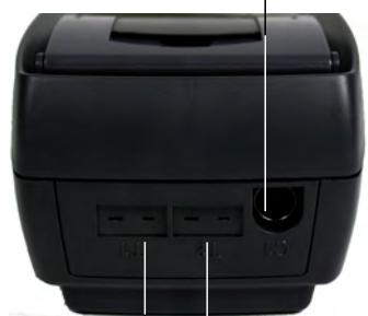
Thermocouples connections Top view

External probes connection (Pt100 temperature, CH 4 ...)