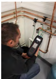
DHW network temperature