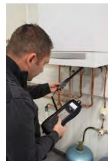
Ambient CO checking