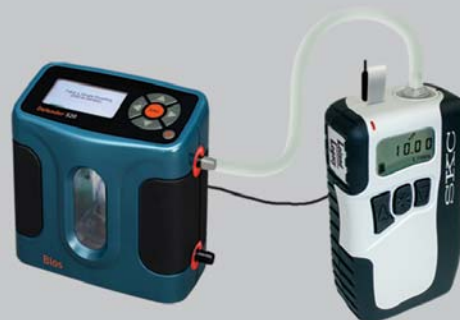
Leland Legacy® in CalChek calibration train