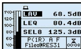
SLM results in 3-profiles view