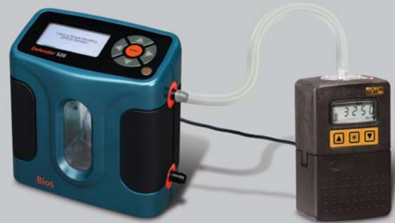
AirChek® 2000 in CalChek calibration train